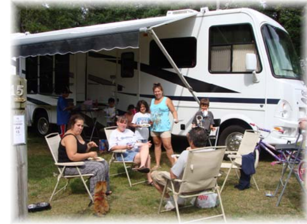
Campers enjoying a summer Bar-B-Q at Coldwater Lake Family Park.