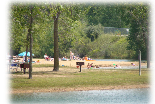
Relax on the beach or take a dip in the pond at Herrick Recreation Area!