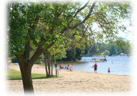
Visitors enjoy a summer day on the beach at Coldwater Lake Family Park.