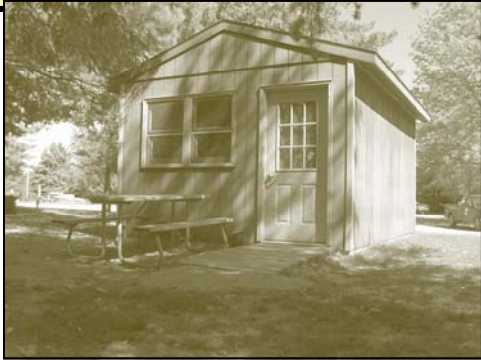
Rustic cabin at Coldwater Lake Family Park

1703 N. Littlefield Road, Weidman, MI 48893 989.644.2388 or 989.772.0911 ext. 340