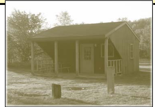
Rustic Cabin at Herrick Recreation Area

6320 E. Herrick Road, Clare, MI 48617 989.386.2010 or 989.772.0911 ext. 340